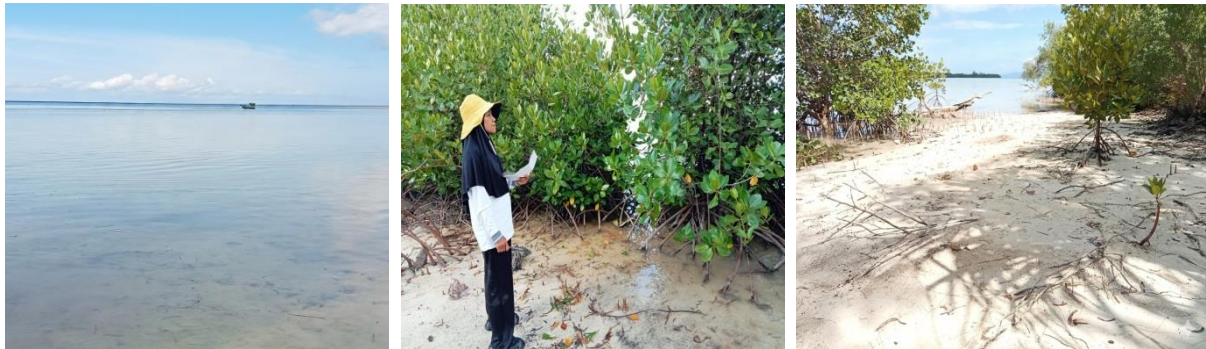
Figure 2. The beauty of the coast and sea of Santari Island (field observation results, March 22, 2026)

The white sandy beaches, crystal clear waters, coral reef ecosystems, and coastal vegetation are key attractions that can be developed into superior tourism products. This is in line with global tourism trends showing increasing tourist interest in nature-based destinations and authentic experiences. However, this potential has not been fully utilized due to various structural constraints. One of the main issues identified is limited accessibility. In tourism development theory, accessibility is a crucial component, alongside attractions and amenities. Without adequate access, a high-quality tourist attraction will not be able to attract significant tourist visits. The limited and unscheduled transportation to Santari Island is a major limiting factor. This has resulted in low tourist visits, as tourists tend to choose destinations that are easily accessible and have a secure travel schedule.